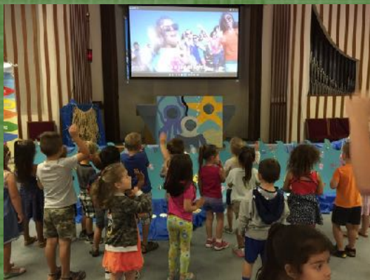
Vacation Bible School "SURF SHACK"