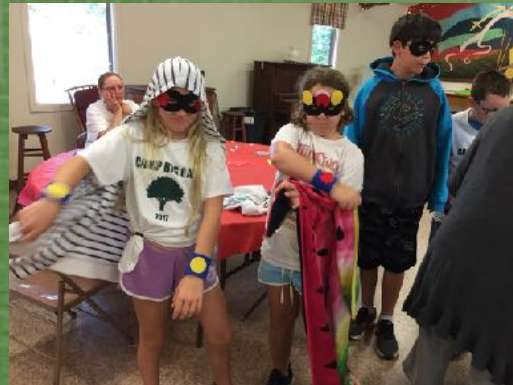
Camp Big Oak