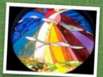
We are a family of professing Christians inspired by Christ's grace and love. We are committed to joyful worship, spiritual growth, caring relationships and