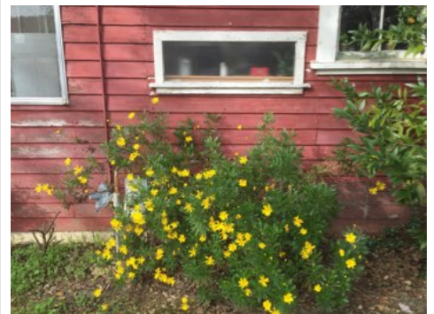
Our "Red Cottage"

Wednesday 10/19/16 CLOSED Thursday 10/20/16 1:00 – 5:00 Friday 10/21/16 9:30 – 1:30 Monday 10/24/16 9:30 – 2:30 Tuesday 10/25/16 1:30 – 4:30 Wednesday 10/26/16 CLOSED Thursday 10/27/16 9:30 – 1:30 Friday 10/28/16 9:30 -1:30 Monday 10/31/16 9:30 – 2:30 HALLOWEEN