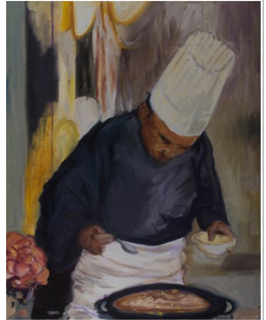
“crepe Suzette”

Sharing Faith will publish a cookbook for sale this fall with recipes provided by our congregation. We are asking for members to provide us recipes either by email to: tdb1141@gmail.com , or faithsr@sbcglobal.net with a PDF, xerox copies, or hand-written. notes dropped in the Sharing Faith slot in the church office.